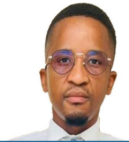
Deputy Executive Mayor Ald Lindile Ntsabo (DA)